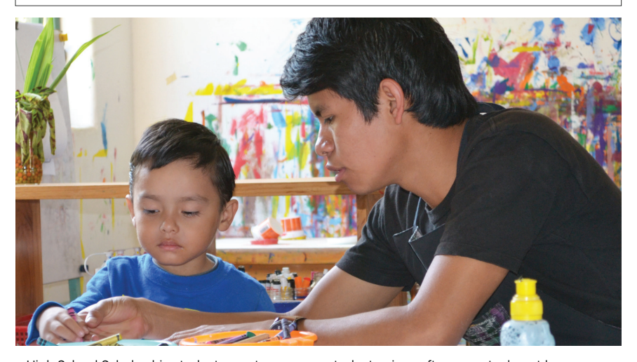
High School Scholarship students mentor younger students, since often parents do not have enough formal education to help their children with their studies. Look for our "Nuestras Notas" blog posts and newsletters to read their stories in their own words.

$500 - A student for one full school year